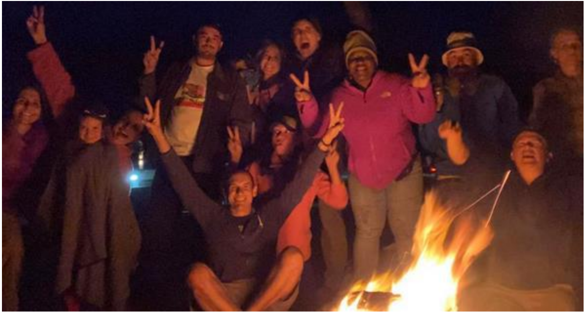
Peaceful Civil Disobedience at Twin Lakes Beach during "The Covid". Santa Cruz Voluntaryists participated in civil disobedience at restaurants, parks, businesses, and beaches with fun events that educated on Voluntaryism and natural Law rights. We educated the police on natural law, the Thick Red Line pledge and illegitimacy of victimless crimes.